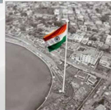
India's Tallest flag 82m high in Marine Drive Raipur