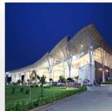
Swami Vivekananda International airport