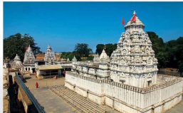
Rajiv Lochan Temple